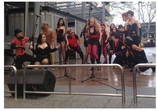
Queensland University of Technology Students Performing World Voice Day 2010 Queen St Mall Brisbane Australia